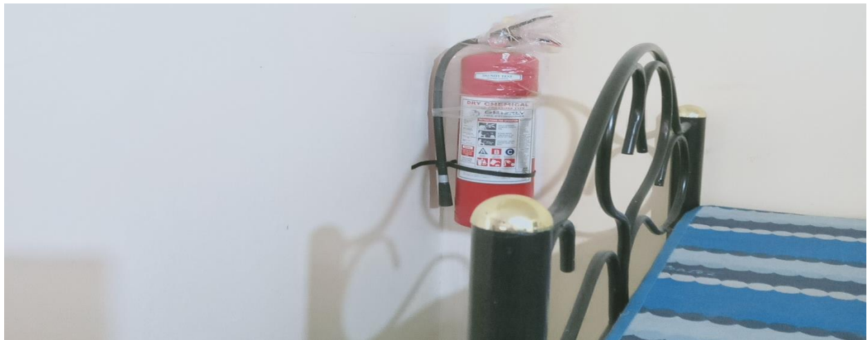
Installed Fire Extinguisher at Male Dormitory