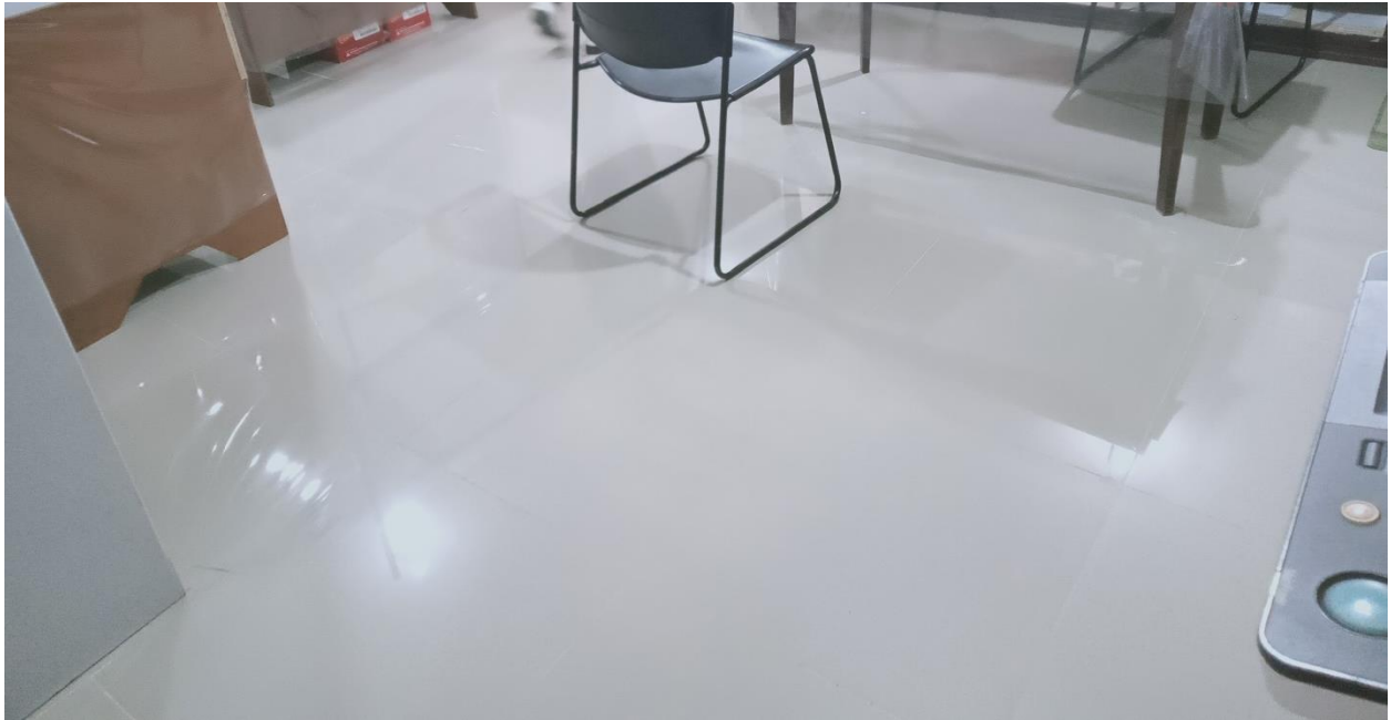
Tiles installed at the flooring of Assessment Office