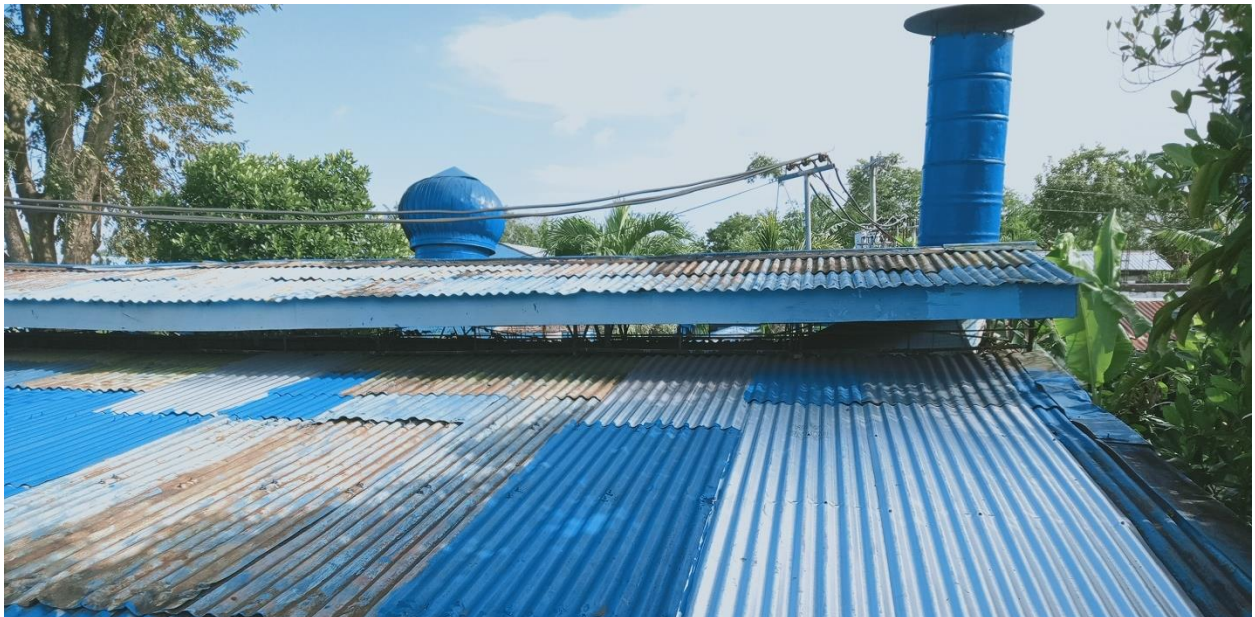
Repaired Building Roof of Welding Building