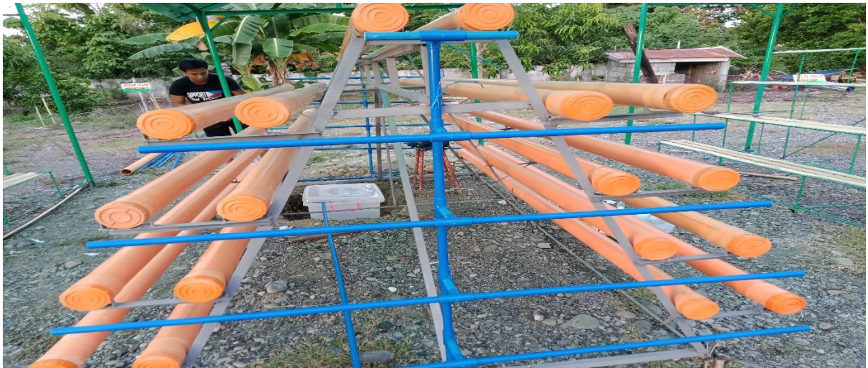
Hydroponics installed with steel frame, PVC pipes and water supply system