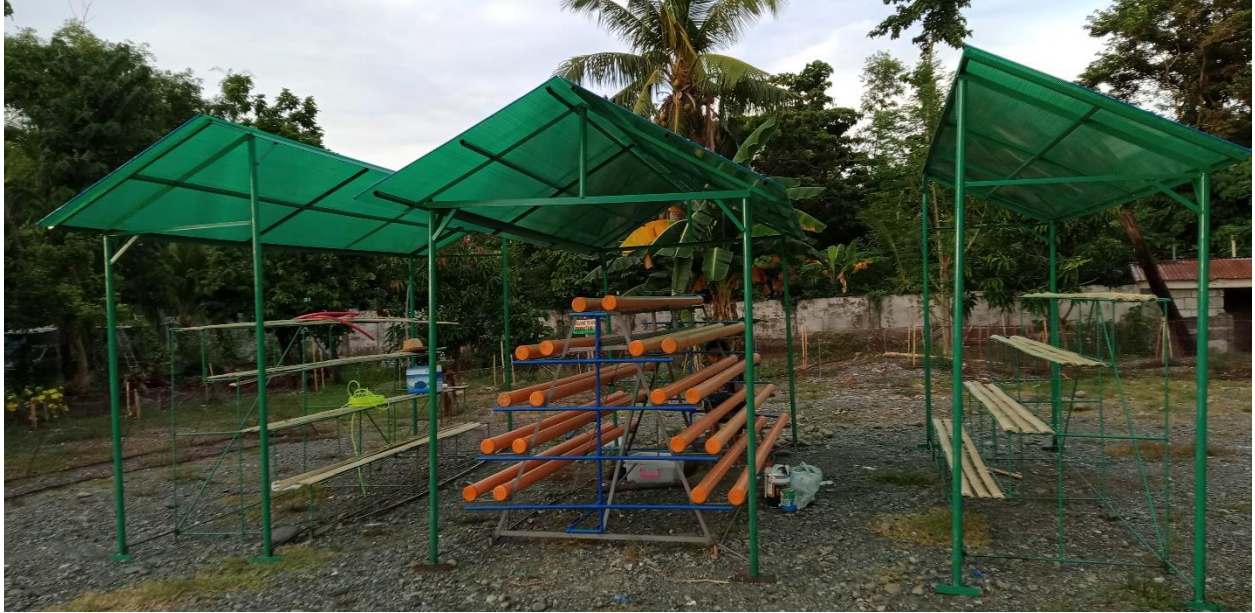
Station for Hydroponics planting facility