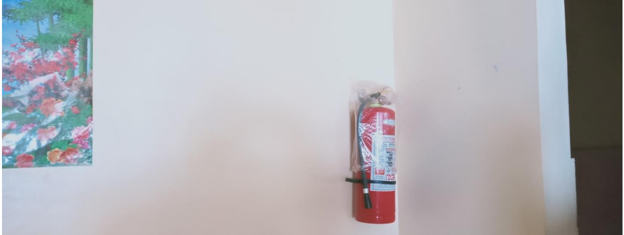
Installed Fire Extinguisher at Female Dormitory