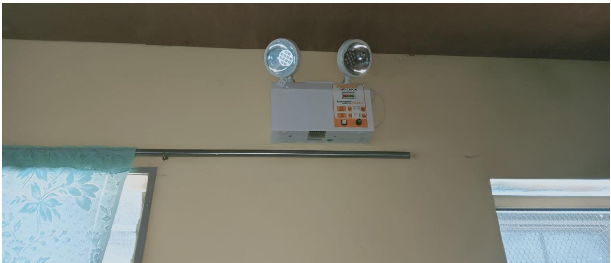
Installed Emergency Lamp at Female Dormitory