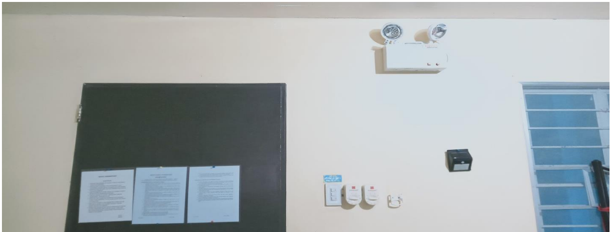
Installed Emergency Lamp at Male Dormitory