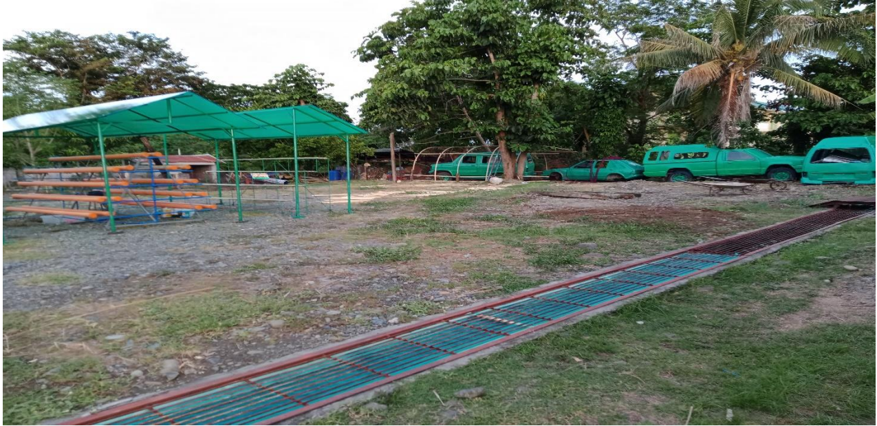
Canal with water supply for Tilapia Fish pond / Unserviceable cars were repainted with green and in secured with bamboo perimeter for cage of Organic Chicken Cage