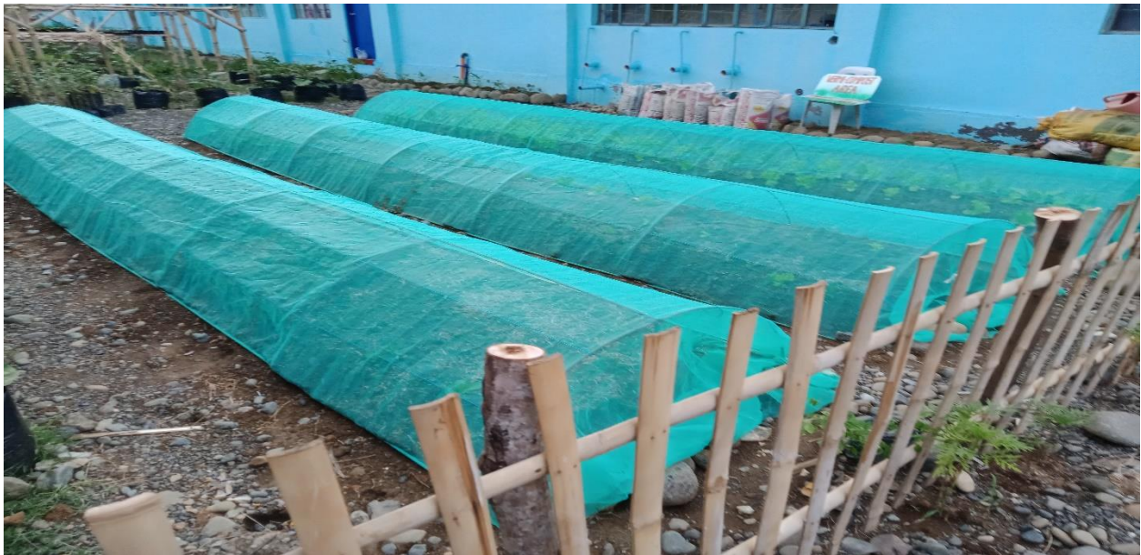
Plots for Plants made of Nylon and Steel Frame