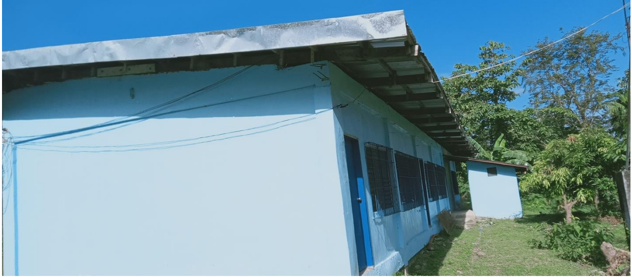
Repaired Building roof of EPAS