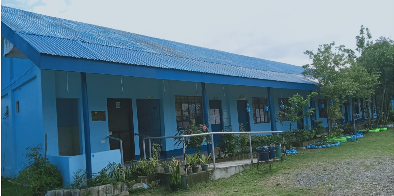
Housekeeping building with extended roof for pathway cover.