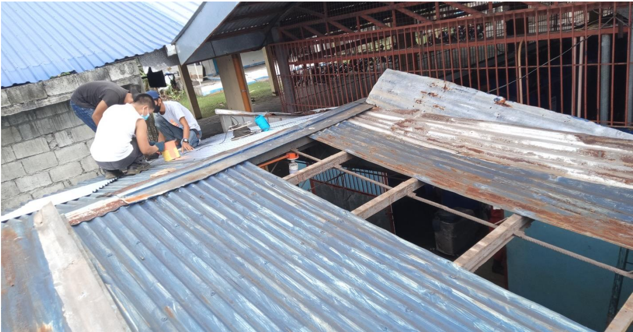
Repaired Building Roof of Welding laboratory waste and segregation area