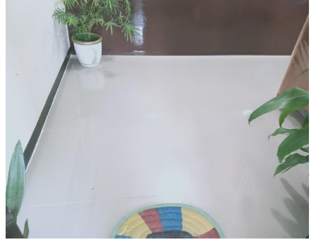
Tiles installed at the flooring of Lobby of Assessment Office