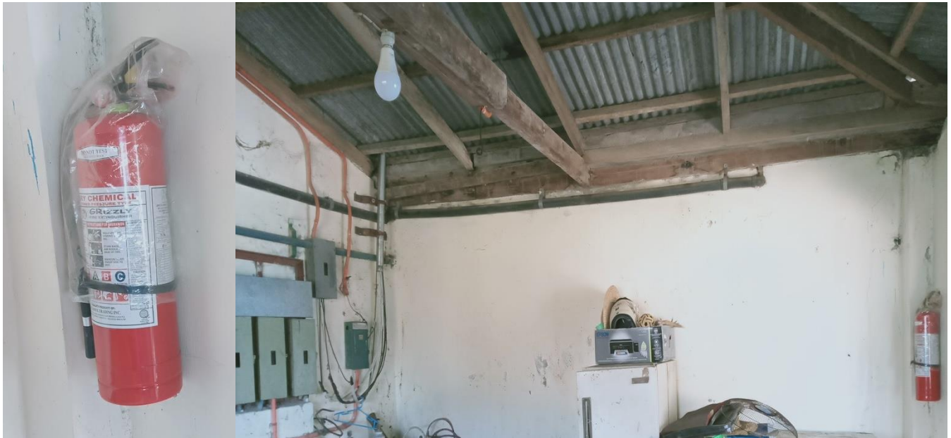
Installed Fire Extinguisher at Power House