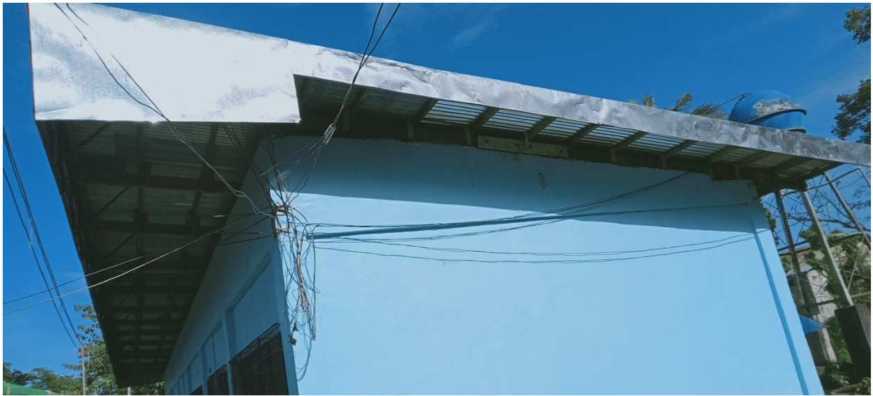
Repaired Building roof of EPAS