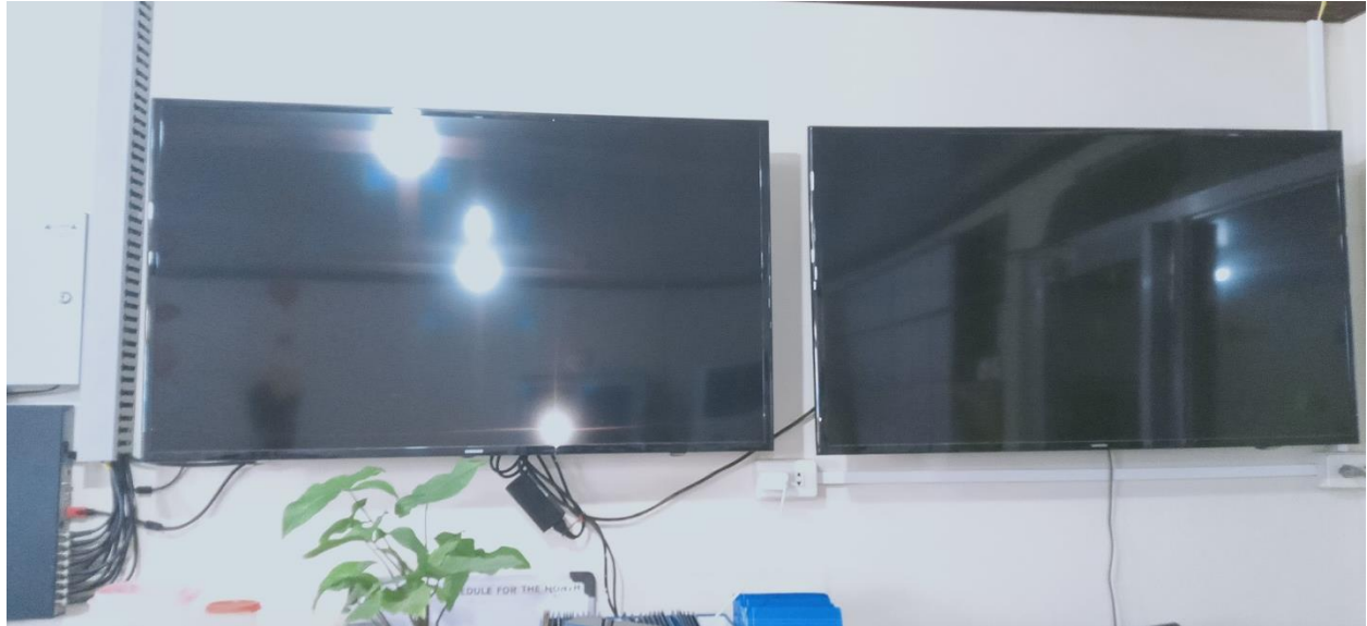
Installed DVR and TV Monitors for CCTV system of the Assessment Center