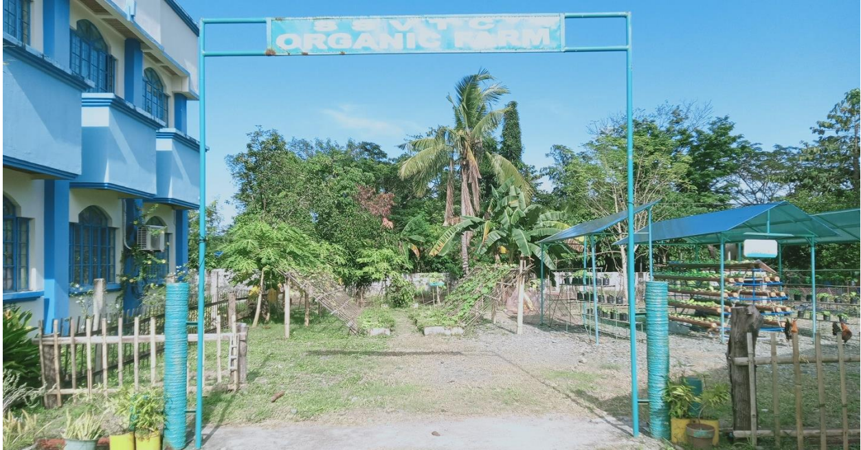
Plant Trellis and Hydroponics