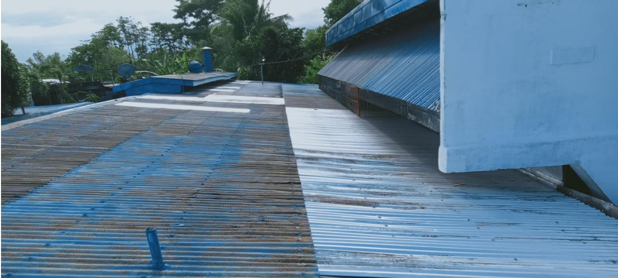
Repaired Building Roof of Welding and Conference Hall