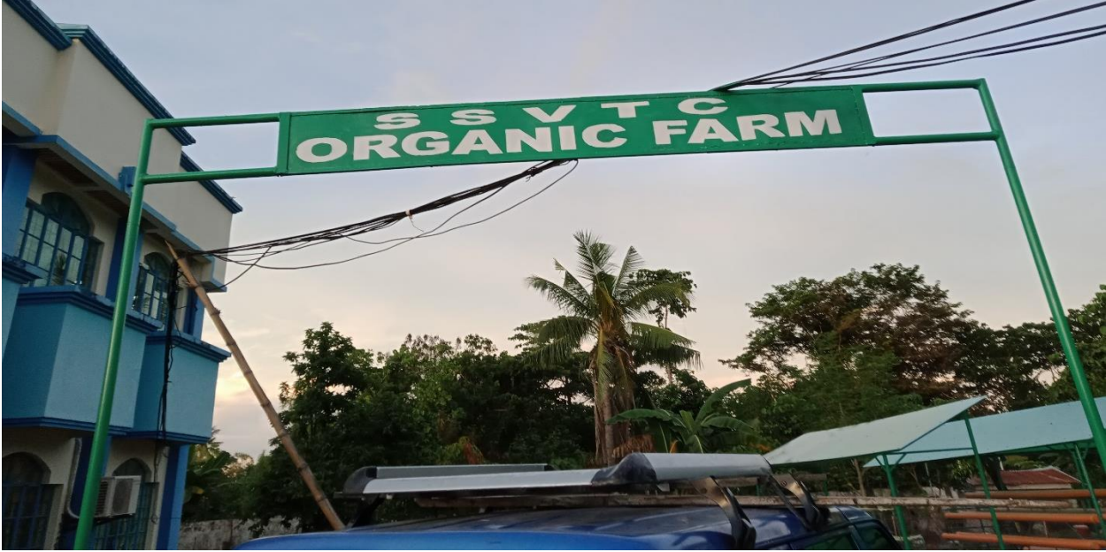
Main Entrance of Organic Farm