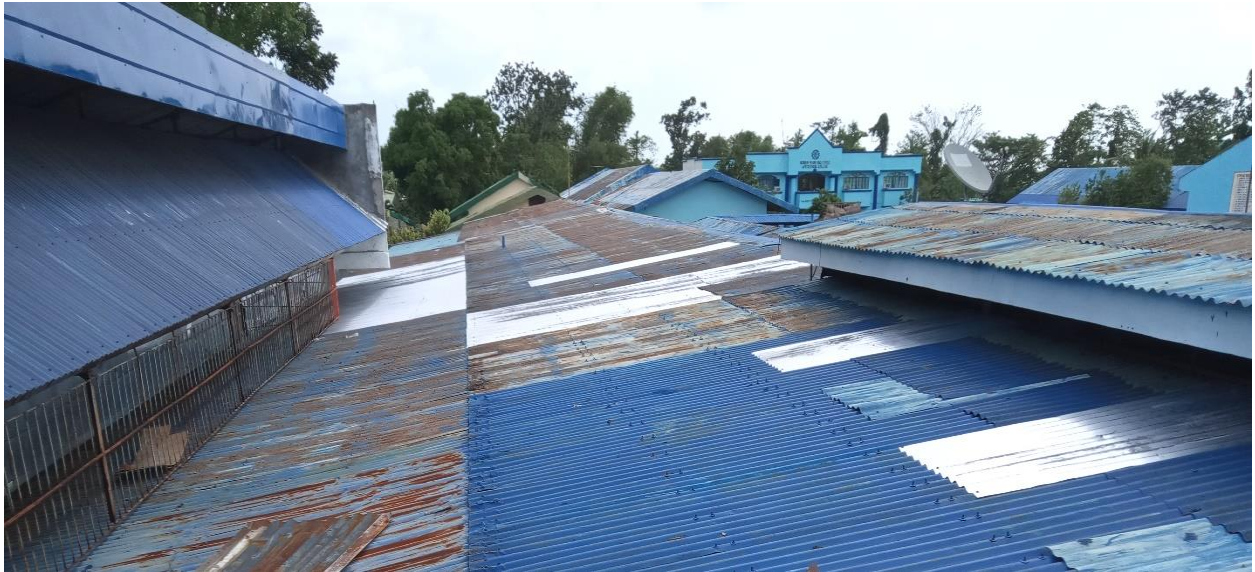
Repaired Building Roof of Welding and Conference Hall