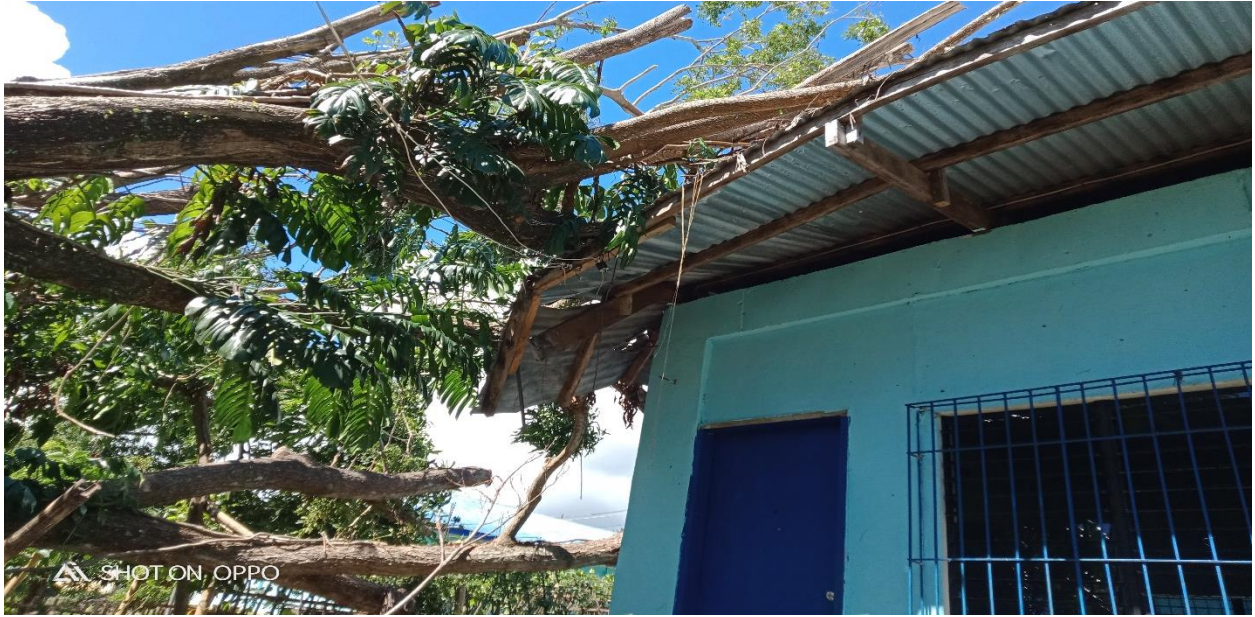
Fallen trees that caused damaged to EPAS Building