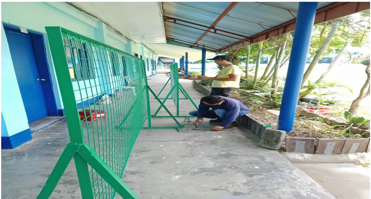
Frame for ornamental and vegetable plants