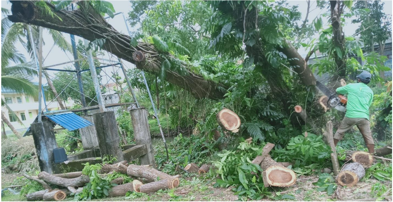
8. Repair of Roof of EPAS Building damaged by typhoon