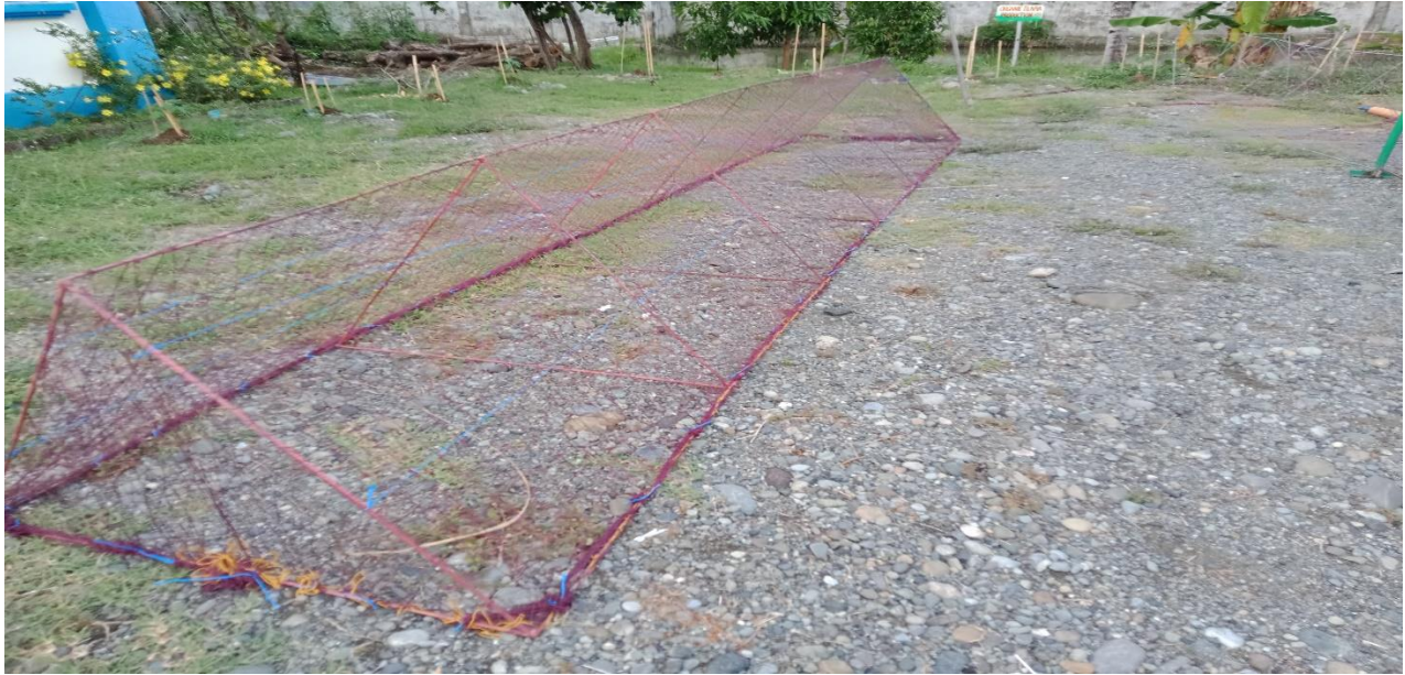
Cage and passage way for organic chicken.