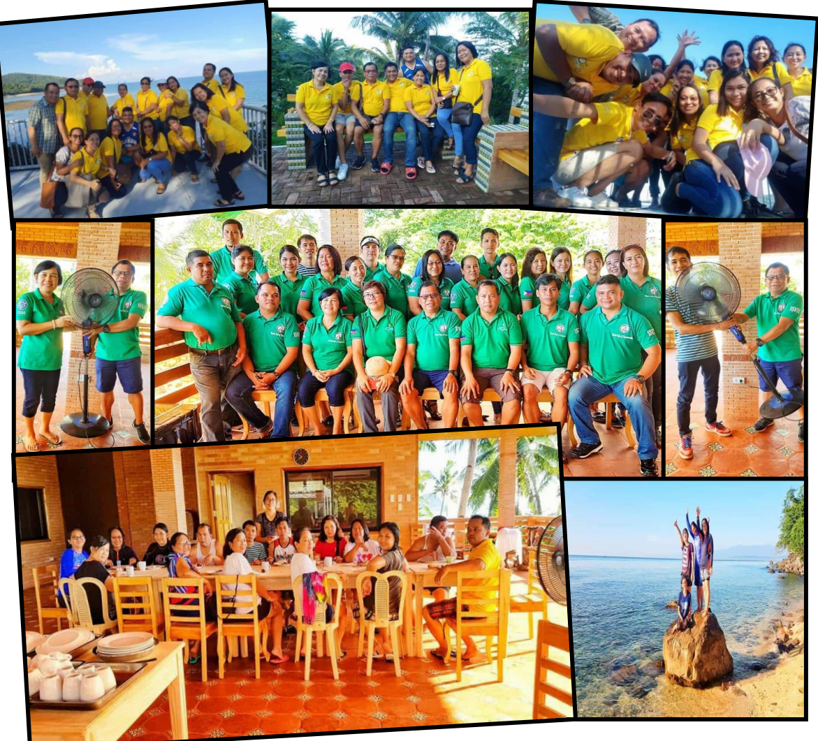
SSVTC Faculty and Staff celebrating Teachers'/Employees' Day at The Sanctuary by POSITADI – Pili Street, Pinamalayan, Mindoro, Oriental Mindoro

To enhance camaraderie and teamwork, SSVTC faculty & staff celebrated Teachers/Employees' Day on September 27, 2019 at POSITADI Resort, Pinamalayan, Or. Mindoro.