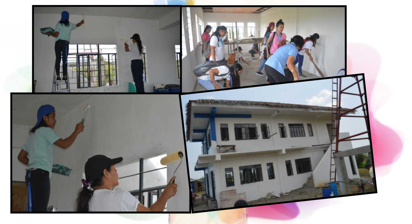
GENERAL ADMINISTRATIVE AND SUPPORT SERVICES