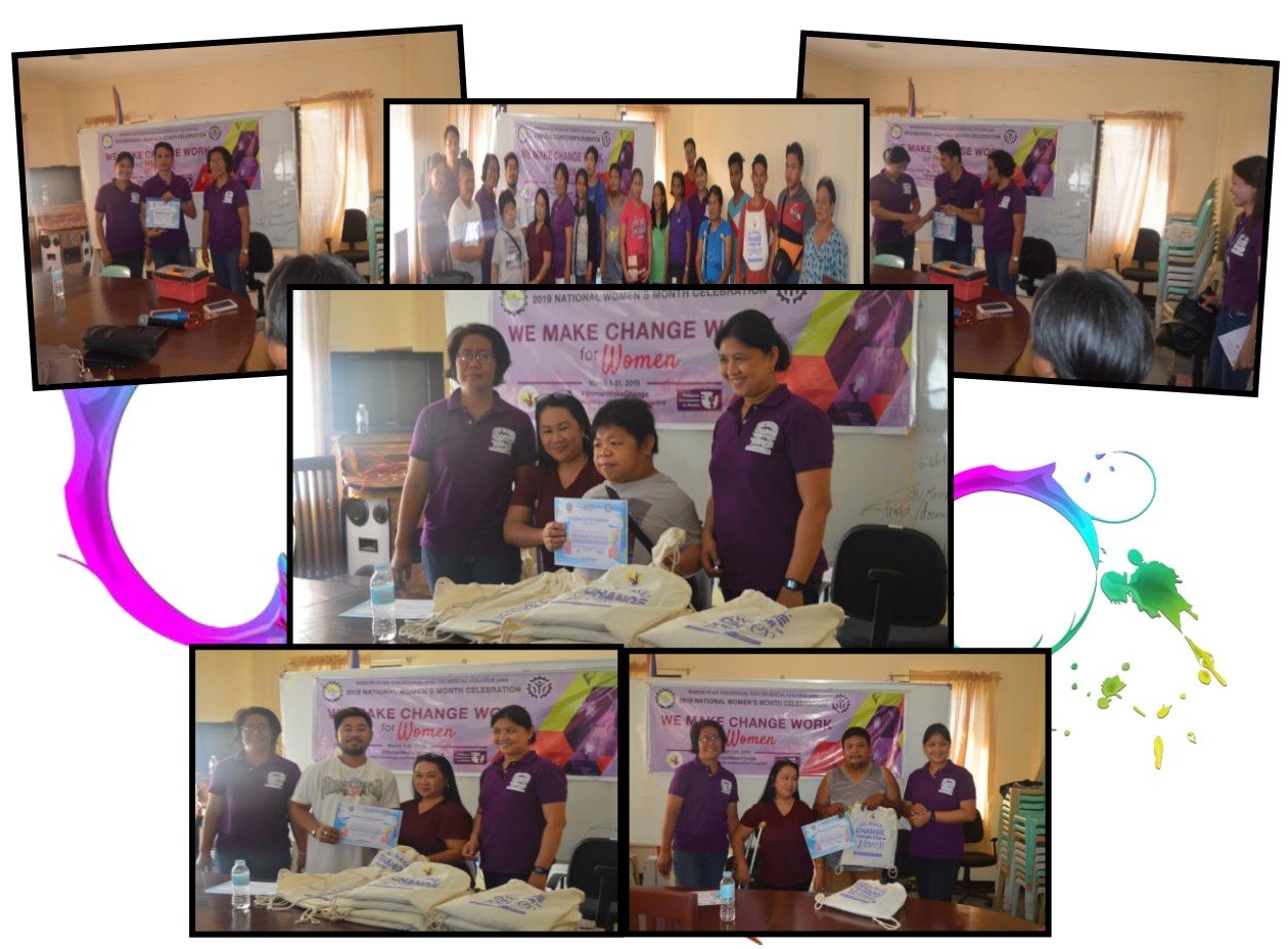
Awarding of Certificates and Giving of tokens to the participants) Teaching and Non-teaching Staff Celebrating National Women's Month 2019