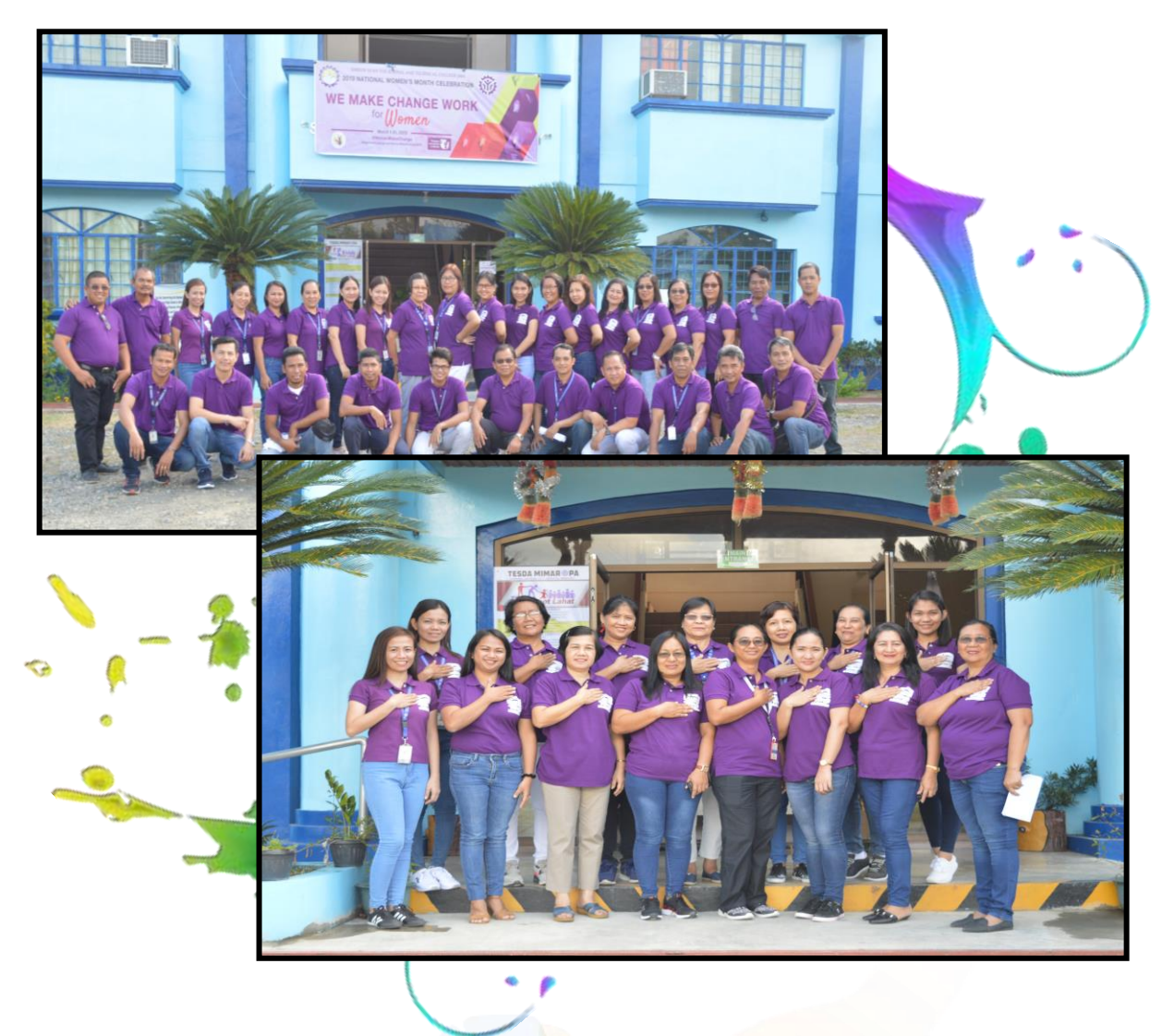
Cleaning and Painting of Farm and School Building